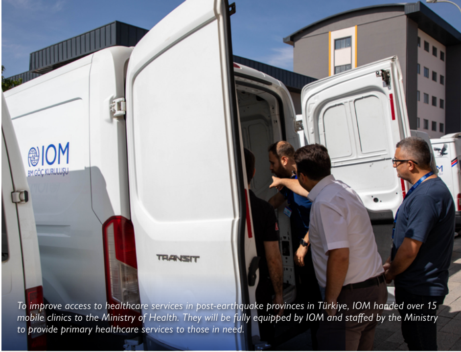
To improve access to healthcare services in post-earthquake provinces in Türkiye, IOM handed over 15 mobile clinics to the Ministry of Health. They will be fully equipped by IOM and staffed by the Ministry to provide primary healthcare services to those in need.