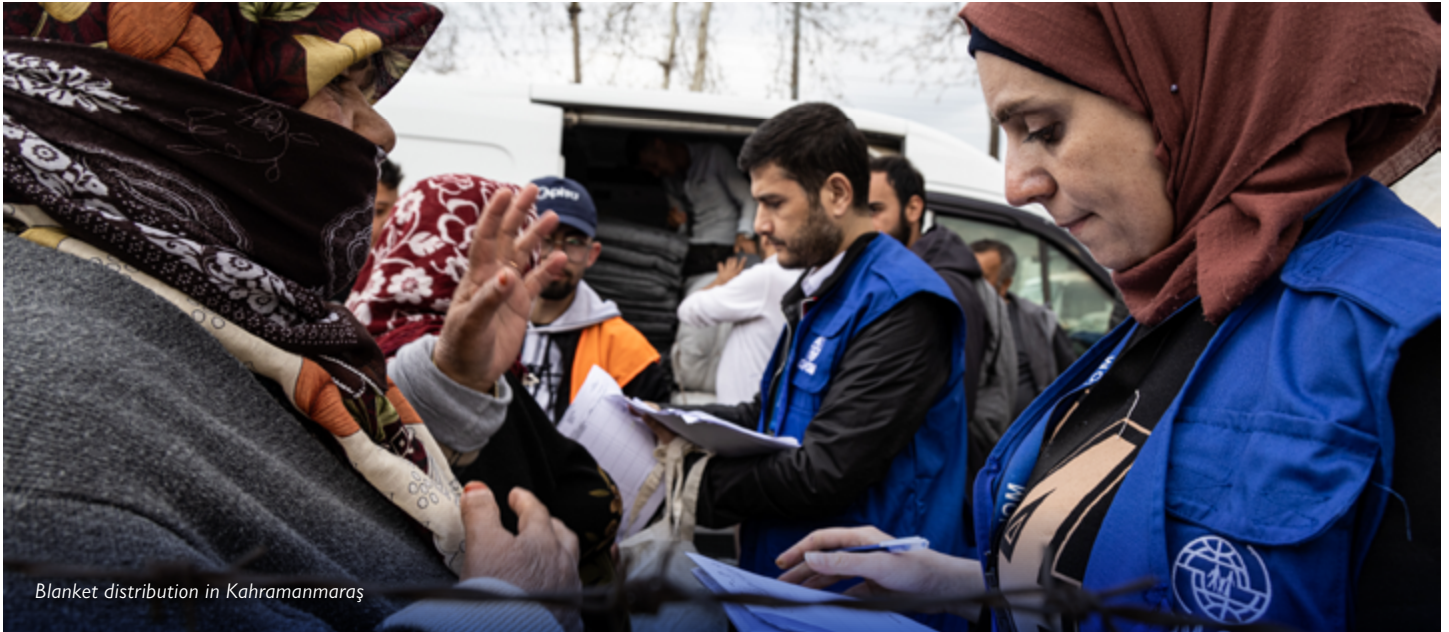
Blanket distribution in Kahramanmaraş