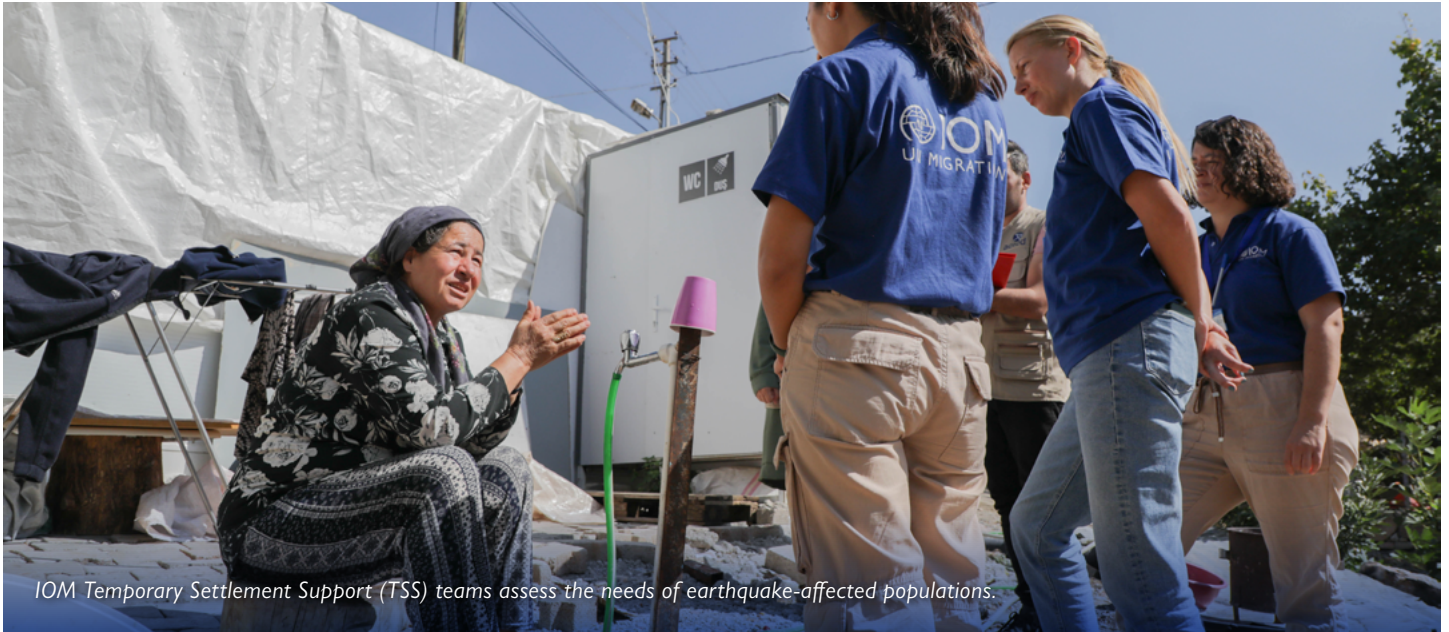
IOM Temporary Settlement Support (TSS) teams assess the needs of earthquake-affected populations.