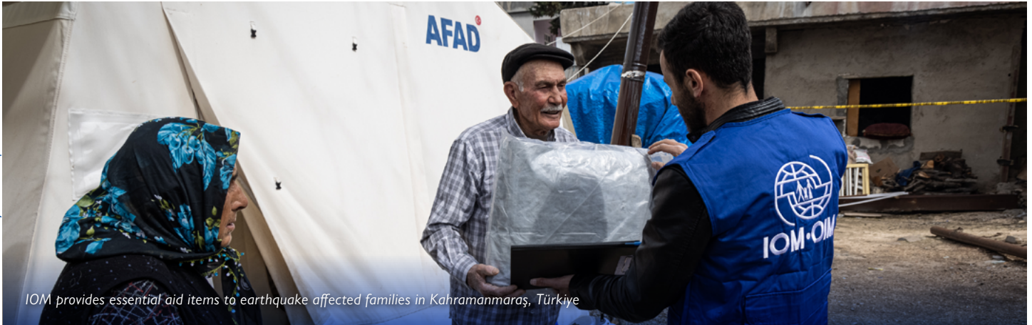
IOM provides essential aid items to earthquake affected families in Kahramanmaraş, Türkiye

With a presence since 1991, IOM has been working in Türkiye for over three decades. In 2004, Türkiye became a full-fledged member state of IOM. As the leading intergovernmental organization in the field of migration, IOM supports the Government to promote safe, orderly and regular migration.