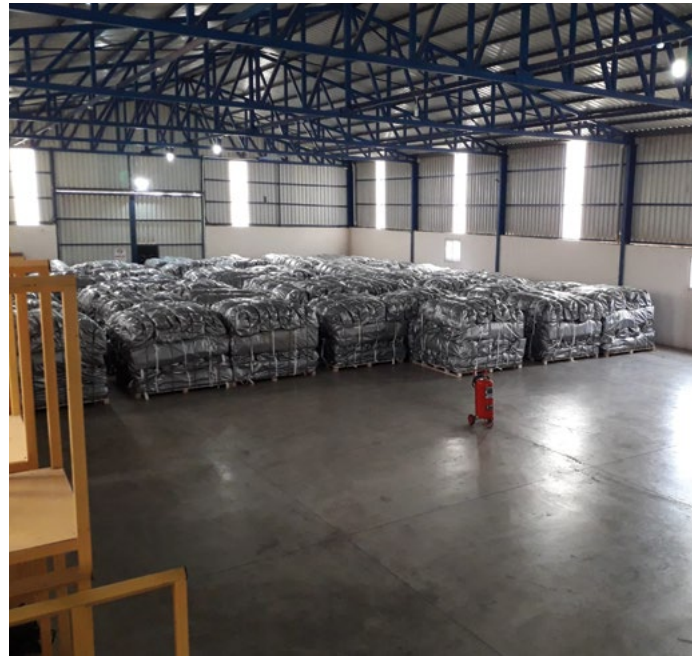
IOM Türkiye's warehouse in Hatay

Warehouse is around 1300 square meters. Regular visits were conducted to monitor and follow up the transshipment process at the government designated borders in Reyhanli (UN HUB). A total of 990 trucks were shipped in the last year.