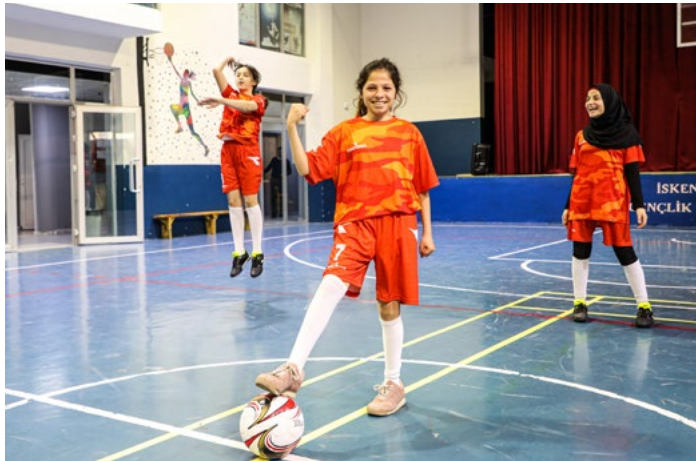
IOM Türkiye's Psychosocial support team organized a football tournament for girls in Iskenderun, Hatay.

Psychosocial Mobile Team (PMT): With the onset of the COVID-19 pandemic in Türkiye, SuTPs and host community members suffer additional psychological stressors brought by the effects of lockdowns, loss of job opportunities, inability to meet basic needs, and self-isolation. To address increasing mental health and psychosocial needs, community-based Mental Health and Psychosocial Support (MHPSS) provision was made available to individuals through the PMT in Hatay covering a range of services including MHPSS, COVID-19 information dissemination, and awareness-raising sessions. Hatay PMT conducted many group-based activities aiming to ensure and increase the mental wellbeing of the society. In Total, the PMT reached 875 beneficiaries.