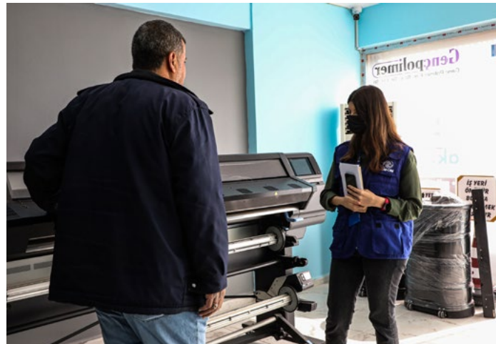
IOM Türkiye's Livelihood team in Hatay purchase a large-sized printer to support beneficiary's business.

Cash Based Interventions (CBI): To improve vulnerable families' access to food and hygiene items, IOM provided 1,590 households in Hatay province with one-time unconditional restricted cash assistance via prepaid cards. In total, 11,507 people benefited from the assistance.