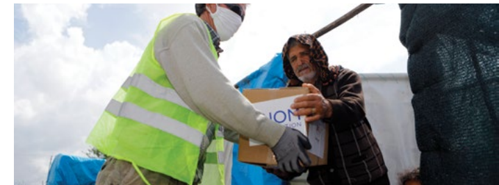
IOM Türkiye and the Mersin Municipality distribute non-food items to some of the most vulnerable beneficiaries.

Adana Governate, Seyhan Municipality and Adana Metropolitan Municipality, Yuregir and Saricam Sub-governates