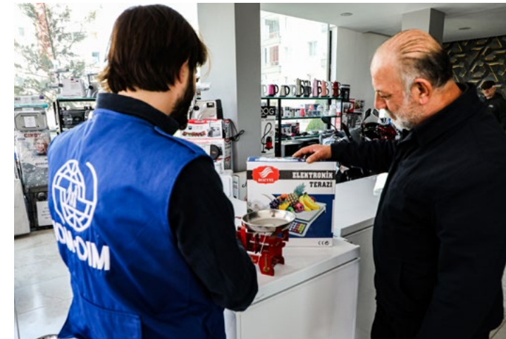
IOM Türkiye's Livelihood team in Hatay purchase a meat grinder, tray, and other appliances to support the beneficiary's restaurant business.

IOM Türkiye implemented 10 community stabilization projects in Adana, Hatay, and Mersin provinces, to assist 13,075 beneficiaries while fostering social cohesion.