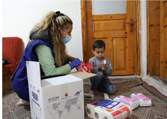
A Recovery and Stabilization Team distributes hygiene boxes to families.

With the support of the Governorate of İstanbul and District Governorate of Esenyurt, selected Women's Association established a Family Support Center where both Turkish citizens and Syrian refugee women receive vocational trainings together. Syrian women participants, after successfully completing the Turkish language course approved by the Ministry of National Education, continue with vocational courses according to their interest in the same center. IOM's support included the provision of 20 desktop computers to establish accounting classes in this center. In addition, basic school supplies for 300 students were donated to the same center.