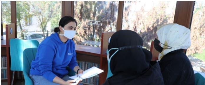
After a Speaking Club activity, an IOM team conducts an evaluation session to assess the activity's impact on the daily life of women participants.

Seven schools were rehabilitated and upgraded in Avcılar and Bağcılar districts to provide a better environment for students, in collaboration with the Provincial Directorate of Migration Management. These seven schools have the highest number of Syrian refugee children in İstanbul. Total student number is 10,090.