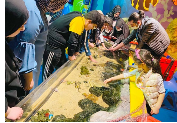
IOM organized a visit to the Istanbul's Sea Life Museum for children to learn about the underwater life and discuss the importance of sea ecology.

In addition, through PRU's Emergency Case Management (ECM) interventions assistance was provided to individuals living in Sultangazi and periphery districts, identified either directly in Sultangazi Municipality or through referrals by solution partners. ECM assisted 896 individuals with medical items, accommodation, transportation, and documentation translation.