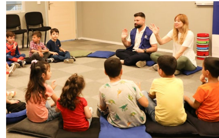
Migrant and refugee children participate in an IOM-organized rhythm and music workshop in Istanbul.

In addition, through PRU's Emergency Case Management (ECM) interventions assistance was provided to individuals living in Sultangazi and periphery districts, identified either directly in Sultangazi Municipality or through referrals by solution partners. ECM assisted 896 individuals with medical items, accommodation, transportation, and documentation translation.