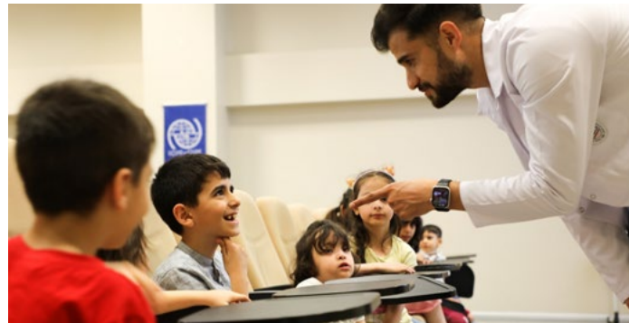
Children participate in an IOM-organized session on oral and dental health in Istanbul.

The Istanbul based Psychosocial Mobile Team (PMT) carries out a Mental Health and Psychosocial Support (MHPSS) Programme located in Sultangazi and Gaziosmanpaşa districts, which is frequently supported by other fields of expertise such as arts, sports, livelihood, education, health, and others. It aims to enhance psychosocial well-being of individuals and communities by strengthening the existing support mechanisms and encouraging adaptation of effective coping strategies. In the first half of 2022, the PMT reached 735 individuals from migrant and refugee communities, and 113 from the host community. Services provided by the PMT include participatory assessments, focused and non-focused MHPSS activities, socio-relational and cultural activities, and information dissemination sessions. Sessions on self-care, music, sports, games, storytelling, and cultural site visits were among the standout activities that were conducted in accordance with the mental health and psychosocial needs of the communities. Additionally, in coordination with district municipalities, awareness-raising activities on topics like delayed speech in children and access to services, including higher education, were developed in response to the individual needs identified by the PMT.