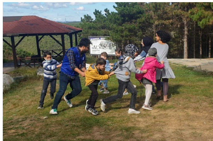
Children and their mothers participate in a thematic activity on well-being organized by IOM Türkiye teams in the Sultangazi urban forest on World Mental Health Day.

The mother-child room and breastfeeding room in the Provincial Directorate of Migration Management building was upgraded by IOM which had a very valuable impact in terms of enabling individual's access to services. In addition, the paint, electrical and air conditioning system of the building was rehabilitated to provide better services and improve the building condition.