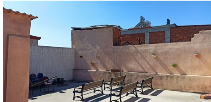
Supporting Education Centre in Buca - Before

Community Stabilization (CS): IOM implemented five CS projects to promote social cohesion in cooperation with Buca Municipality, Çiğli Municipality, Karabağlar Sub-Governorate, and Torbalı Sub-Governorate to renovate kindergartens, an activity hall, the establishment of a computer laboratory, provision of sports equipment and furniture, reaching 5,020 beneficiaries.