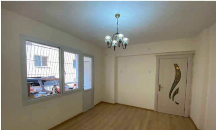
Konak, İzmir - Shelter after rehabilitation