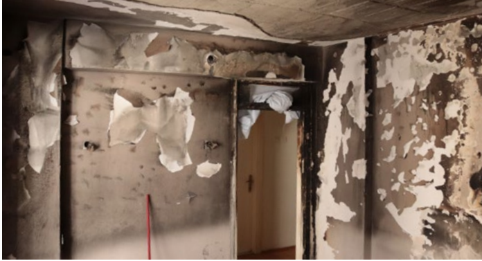
Konak, İzmir - Shelter before rehabilitation

Shelter Rehabilitation: 51 shelters were rehabilitated to strengthen the living conditions of migrant, refugee, and local communities in the Konak and Torbalı districts. The project has reached 291 beneficiaries: 219 from migrant and refugee communities and 72 from the local community.