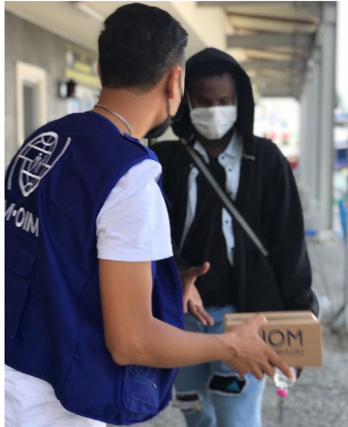
IOM Mobile Team providing food kit to a migrant who was rescued by the Turkish Coast Guard in Dikili, İzmir.

IOM has established mobile teams along the Aegean Coast to support the efforts of the Turkish Coast Guard (TCG), Gendarmerie, and Police, by providing humanitarian aid which includes, food and non-food items (NFI), psychosocial support, interpretation, medical assistance, and referral to migrants rescued/intercepted/apprehended at sea and land. A total of 21,889 migrants were assisted.