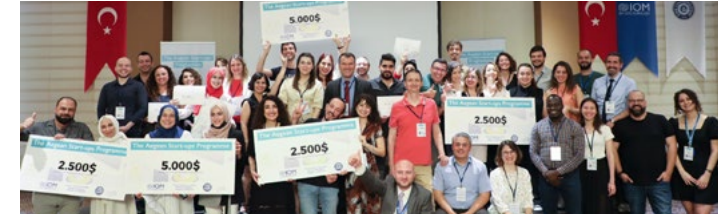
The five winning teams of the Aegean Start-up Programme receive their awards at a closing ceremony in İzmir.

Livelihood: In cooperation with Ege University, IOM implemented a Technology-Based Entrepreneurship programme in the Aegean Region that aims to improve participants' knowledge and business skills; increase their socio-economic resilience with mentoring and entrepreneurship trainings. 363 participants benefited from the trainings and 5 winning teams received seed grants.