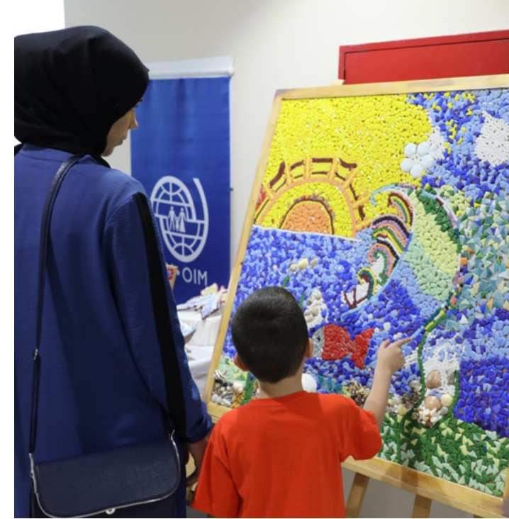
A mosaic exhibition organized by IOM in cooperation with the Bornova Municipality to present artworks made by women from migrant and local communities.