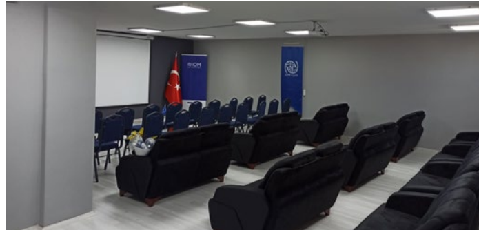
Supporting Education Centre in Buca - After

Livelihood: In cooperation with Ege University, IOM implemented a Technology-Based Entrepreneurship programme in the Aegean Region that aims to improve participants' knowledge and business skills; increase their socio-economic resilience with mentoring and entrepreneurship trainings. 363 participants benefited from the trainings and 5 winning teams received seed grants.