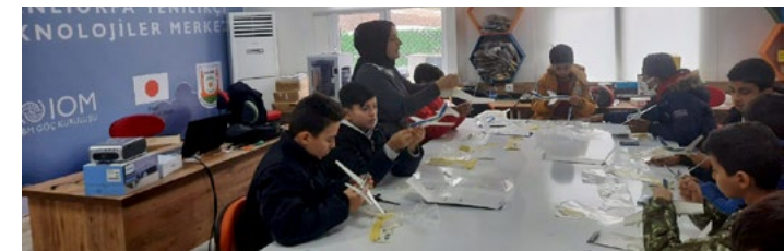
IOM Türkiye's Livelihood team in Şanlıurfa delivers a session as part of the Robotic Coding and Mentorship programme.

Livelihood Support: In coordination with the Şanlıurfa Metropolitan Municipality, IOM provided livestock support to 40 rural families through the community farming model. Additionally, twenty women were employed in the innovative greenhouse established by IOM Türkiye in Eyyubiye district. Vocational training courses were organized for 84 women in Midyat and Kiziltepe provinces of Mardin. IOM assisted 80 qualifying businesses in the form of small business support cash grants in Şanlıurfa and Mardin. Furthermore, Robotic coding and Mentorship trainings were completed in the Şanlıurfa Migrant Center, with 103 trainees receiving tablets upon successful completion of the courses.