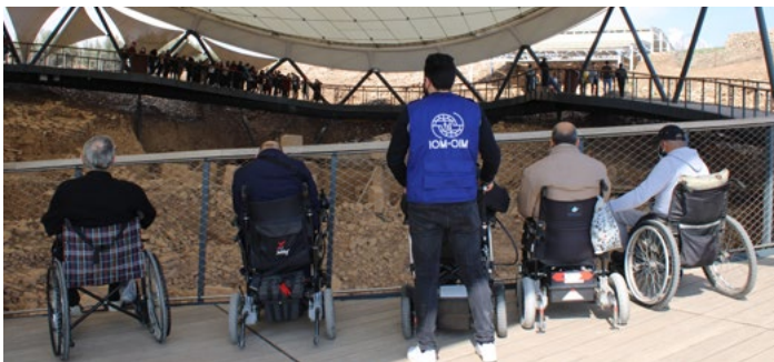
People with disabilities are on a cultural trip to Göbeklitepe organized by IOM Türkiye's Psychosocial Support Team in Şanlıurfa.

Municipal Migrant Community Centre: In partnership with the Şanlıurfa Metropolitan Municipality, IOM supports both communities to access to services available to them. This includes psychosocial support, counselling on access to different services along with socio-cultural activities. Over the year, the PMT reached 28,610 beneficiaries through a variety of assistance and activities. And 7,362 beneficiaries supported with COVID-19 info and hygiene kits.