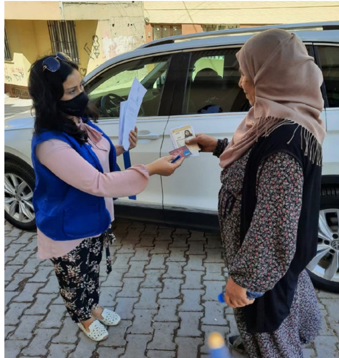
IOM Türkiye's Cash-Based Interventions team in Şanlıurfa delivers debit cards to families in need to purchase essential goods.

Emergency Cash Assistance: IOM provided one-time cash assistance to 961 families in Şanlıurfa and Mardin for 5,632 of the most vulnerable refugees through debit cards as delivery mechanisms to mitigate the direct impact of the COVID-19 crisis.