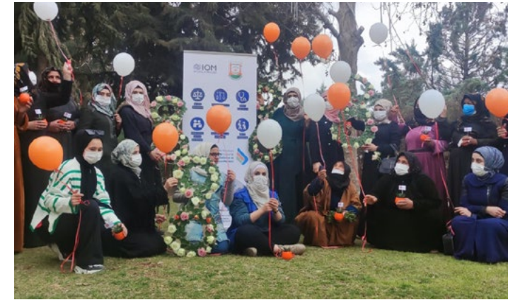
IOM Türkiye organized a celebration event to mark International Women's Day in Şanlıurfa.

4,750 HYGIENE KITS FOR 28,500 INDIVIDUALS