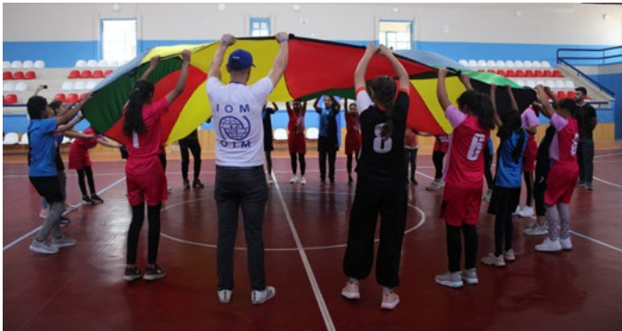
To build harmony in the community, IOM Türkiye's Psychosocial Support team organized a football tournament in Şanlıurfa for young Turkish and Syrian girls.

Psychosocial Mobile Team (PMT): With the onset of the COVID-19 pandemic in Türkiye, refugees, migrants, and host community members suffer additional psychological stressors brought by the effects of lockdowns, loss of job opportunities, inability to meet basic needs, and self-isolation. To address increasing mental health and psychosocial needs, community-based Mental Health, and Psychosocial Support (MHPSS) provision was made available to individuals through the Psychosocial Mobile Teams covering a range of services including MHPSS, COVID-19 information dissemination, and awareness-raising sessions. Over the year, the PMT reached 7,772 beneficiaries through a variety of activities.