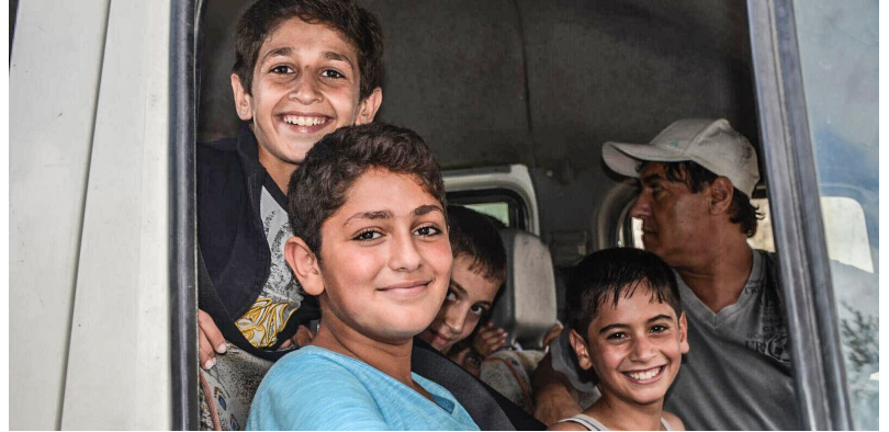
IOM provides school transportation for children to attend school in southeastern Turkey.

This summer, schools were open and busy for many Syrian students living in Turkey. With the support of IOM's school transportation project, approximately 7,000 students were provided with transportation to school and back, over half of those students were girls. Because of IOM's school transportation programme, families are able to overcome geographical distances which is often a barrier to education. By attending summer school, Syrian children who have been out of school have the opportunity to improve their Turkish language proficiency and take catch up classes to be better prepared for the new school year this September.