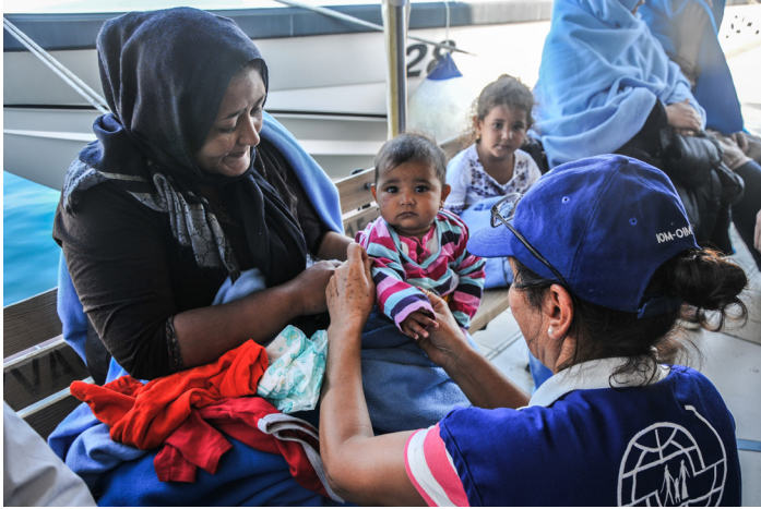
Clothing and shoes are provided to migrants & refugees rescued at sea