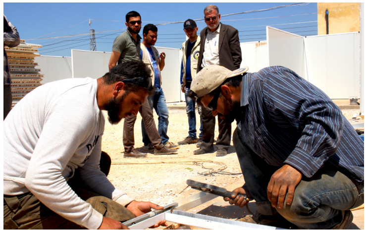
IOM's implementing partners inside Syria build shelters in line with the HLP standards.

Additionally, IOM's Housing Land and Property (HLP) team held a training for Shelter Cluster members on the operationalisation of common shelter standards. This training is compulsory for any organisation intending to access the Humanitarian Fund and will go a long way towards ensuring that international shelter standards are properly implemented in Syria.