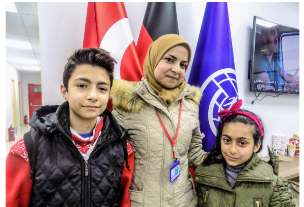
A mother and her two children visit IOM's FAP Office to reunite with their family members in Germany.

From July to September 2017, a total of 3,394 beneficiaries had access to the walk-in facilities in Turkey, providing a range of services from re-scheduling visa appointments with the consulates, fast-tracking special cases and assisting in form-filling and file organization while IOM's call centre handled over 26,000 calls during the same period. Unaccompanied minors (UAM) and beneficiaries with special needs are provided urgent assistance with immediate referral to the consular visa section. Escort services for UAM, transportation and accommodation services have been facilitated in special cases. The presence of IOM staff at the German Consulates continue to support beneficiaries with the family reunification procedures as well as providing support to and liaise with German Consular staff.