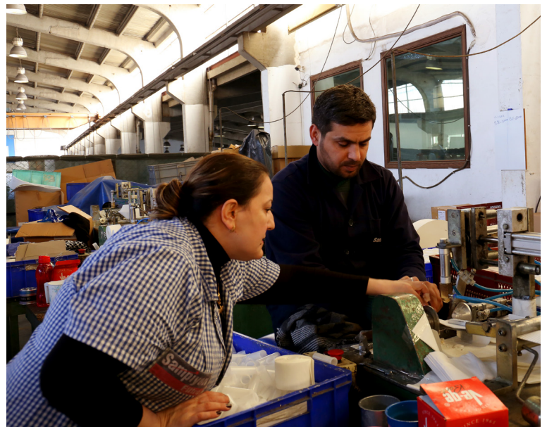
Job placement beneficiary at work.

Given the growing global focus on migration and development, IOM's Labour Mobility and Human Development Unit works closely with the Ministry of Development and other UN Agencies to mainstream migration in national development planning and the nationalization of UN Sustainable Development Goals (SDGs) in accordance with the 11th National Development Plan.