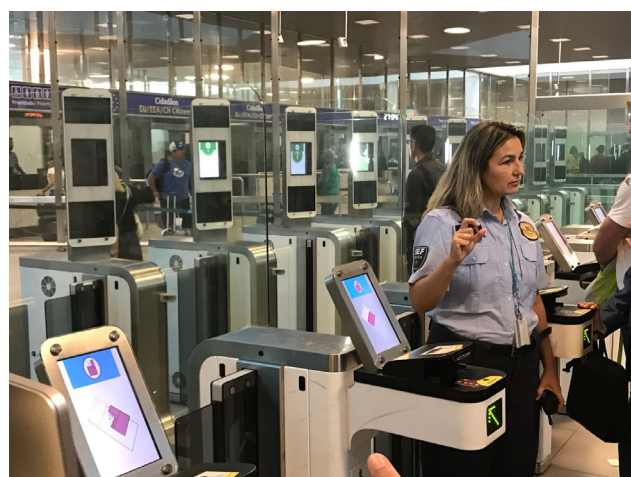
Border management officials during a study visit in Portugal

In September, IOM conducted a 5-day training in Antalya for 44 Turkish sub-governors/deputy governors and airport staff to deepen their knowledge about regulatory and institutional frameworks, procedures, communications and information exchange to better coordinate border management functions. Furthermore, 12 Turkish border management officials joined IOM's team on a study visit to Portugal to observe similarities and differences regarding the legislative framework and the structure as well as the responsibilities and distribution of tasks within the national border and migration authorities. Particular attention was paid to preventing and tackling cross-border crime such as trafficking in human beings and migrant smuggling.