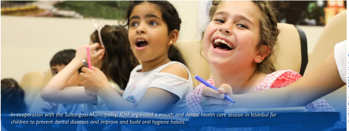
In cooperation with the Sultangazi Municipality, IOM organized a mouth and dental health care session in İstanbul for children to prevent dental diseases and improve and build oral hygiene habits.