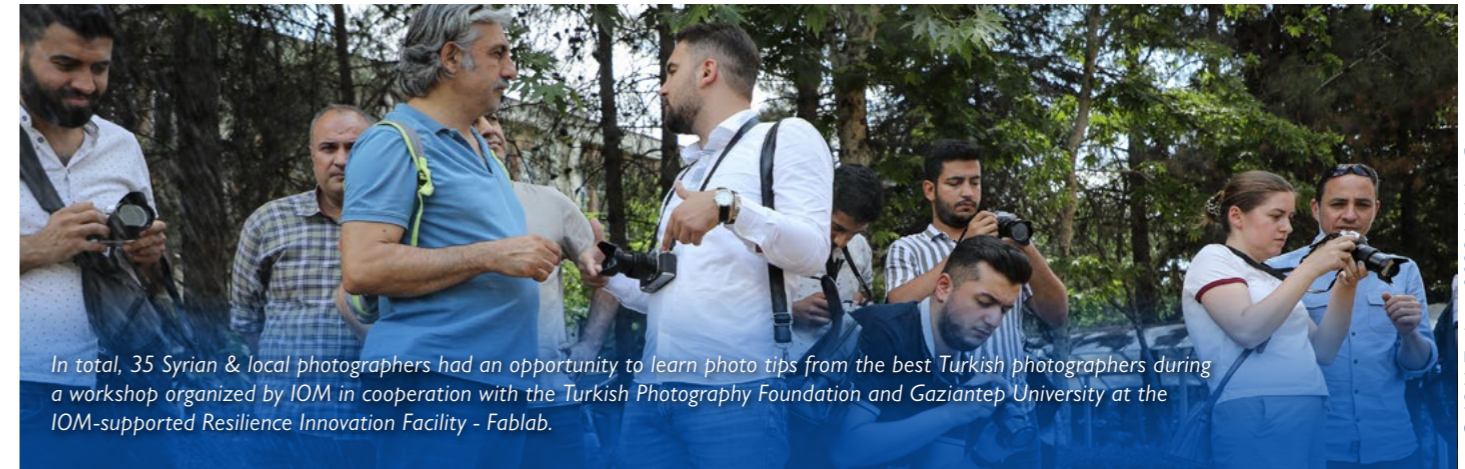
In total, 35 Syrian & local photographers had an opportunity to learn photo tips from the best Turkish photographers during a workshop organized by IOM in cooperation with the Turkish Photography Foundation and Gaziantep University at the IOM-supported Resilience Innovation Facility - Fablab.

IOM supported nine Entities in Adana (Seyhan Municipality), Hatay (Kirikhan Municipality), İstanbul (Bağcılar Municipality), İzmir (Torbalı National Education Directorate), Kahramanmaraş (Kahramanmaraş PDMM), Kilis (Kilis Municipality), Manisa (Yunus Emre Municipality) and Şanlıurfa (Şanlıurfa Metropolitan Municipality, Eyyubiye Municipality) with PPE, Machines and Tools under Covid-19 Response. The support serves to disinfect public areas using the donated machines and tools.