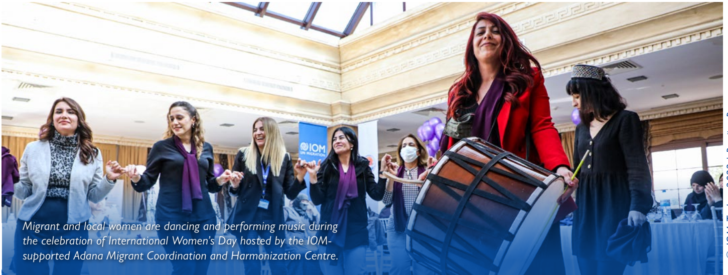
Migrant and local women are dancing and performing music during the celebration of International Women's Day hosted by the IOM-supported Adana Migrant Coordination and Harmonization Centre.