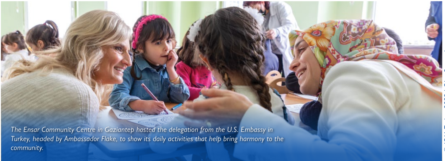
The Ensar Community Centre in Gaziantep hosted the delegation from the U.S. Embassy in Turkey, headed by Ambassador Flake, to show its daily activities that help bring harmony to the community.